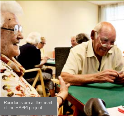
Residents are at the heart of the HAPPI project